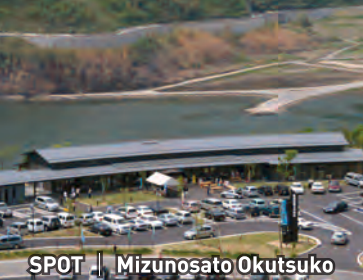
SPOT | Mizunosato Okutsuko