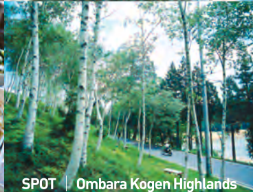
SPOT | Ombara Kogen Highlands