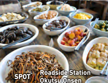
SPOT | Roadside Station Okutsu Onsen