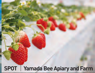
SPOT | Yamada Bee Apiary and Farm