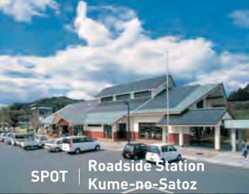
SPOT | Roadside Station Kume-no-Sato