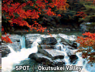
SPOT | Okutsukei Valley