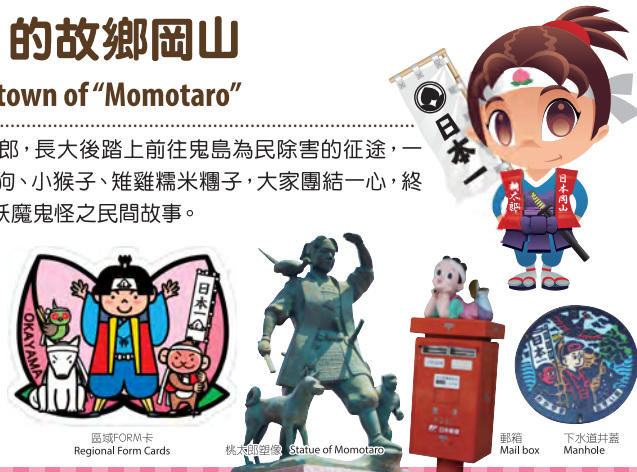
區域FORM卡 Regional Form Cards 桃太郎留聲機 Statue of Momotaro 郵箱 Mail box 下水道井蓋 Manhole

Momotaro, born from a giant peach grew up strong and went on a journey with his companions, a dog, a monkey and a pheasant all given kibidango by Momotaro. They went on to subdue the ogres who were menacing the local people.