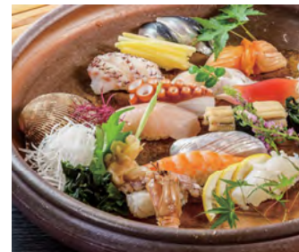
壽司及生魚片 Sushi and Sashimi 都是瀨戶內海捕獲的鮮魚海貝，味道絕美。 Fresh fish from the Seto Inland Sea are a taste sensation.

山珍海味，岡山的絕品美食會讓你讚不絕口! Excellent gourmet dishes of Okayama, from the mountains and the sea, bon appetit!