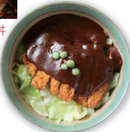
岡山牛肉醬汁炸豬排丼 Okayama Demi-Katsudon (bowl of rice, topped with pork cutlet) 與普通的炸豬排丼不同，別有風味。 吃過一次會讓你入迷。 Slightly different from ordinary katsudon. It hooks you once you try it.