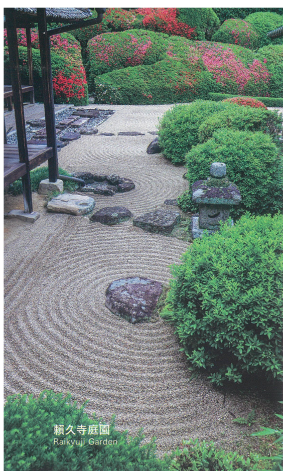
賴久寺庭園 Raikyuj Garden