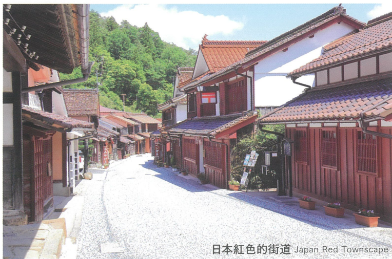
日本紅色的街道 Japan Red Townscape

旧吹屋小学校 Former Fukiya Elementary School ■高梁市成羽町吹屋1290-1 ■Phone 0866-29-2811 ■營業時間 10:00~16:00 ■休息日 12/29~1/3