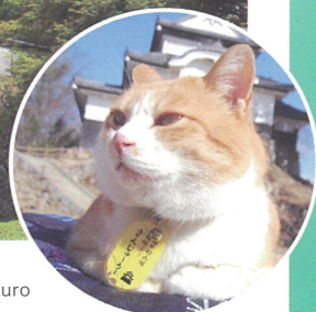
和貓城主三十郎 Castle lord cat Sanjuro