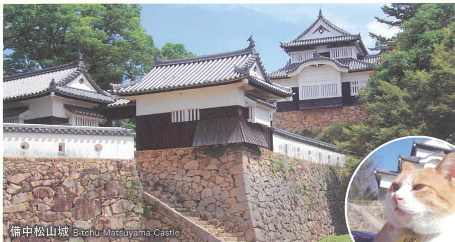
備中松山城 Bitchu Matsuyama Castle